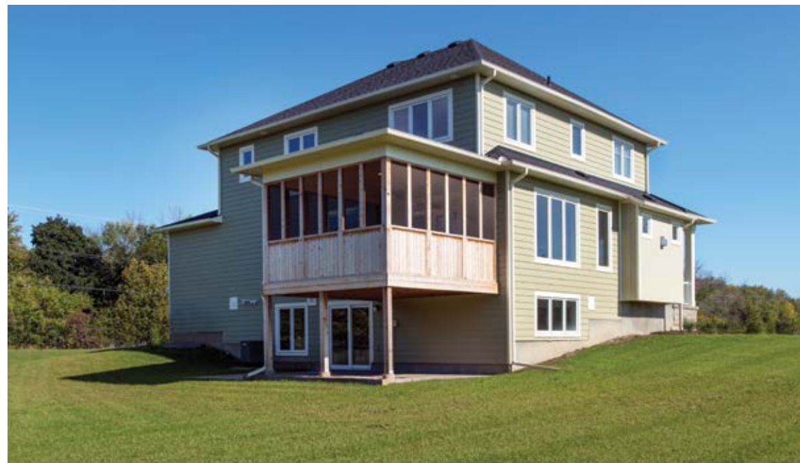
ABOVE: A rear screened porch really makes this home feel like a cottage, perfect for relaxing on a summer evening. LEFT: This home has great outdoor space, including a generous yard and covered terrace by The Ultimate Backyard.