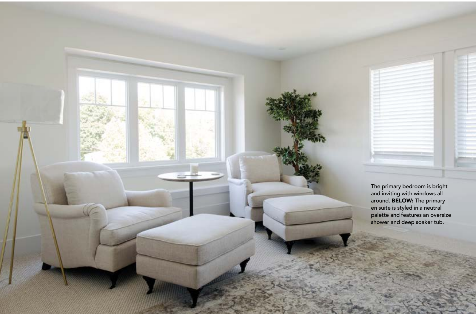
The primary bedroom is bright and inviting with windows all around. BELOW: The primary en suite is styled in a neutral palette and features an oversize shower and deep soaker tub.